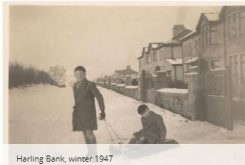
Harling Bank, winter 1947