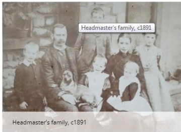
Headmaster's family, c1891