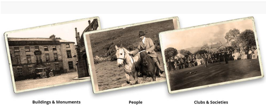
Buildings & Monuments