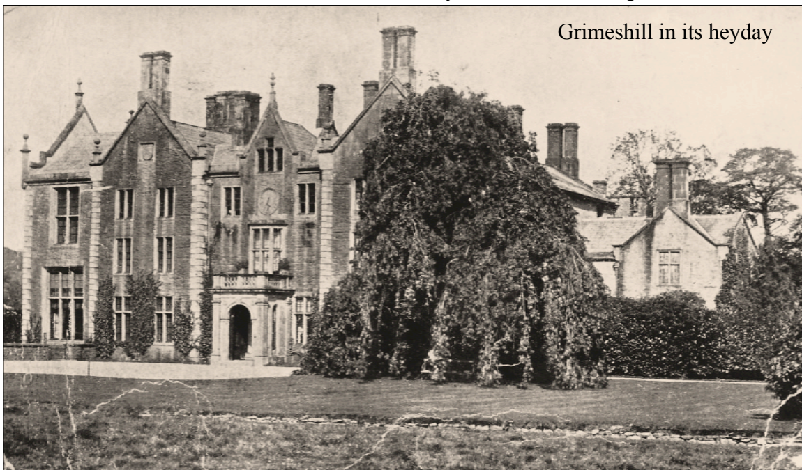
Grimeshill in its heyday

In pre-Tudor times Middleton Hall under the Middleton family had held the most significant role and the remains