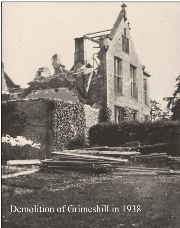
Demolition of Grimeshill in 1938

of the fortifications provide a visible reminder of the threats that had to be guarded against at that time. Nor were the turbulent days of the English Civil War without their problems. In spite of these problems, however, at some time in the Seventeenth Century the Moore family built Grimeshill, a substantial house. The Moores had assumed a significant position in Middleton and with the family line of the Middletons ending at that time the head of the Moore family came to assume the role of Lord of the Manor.